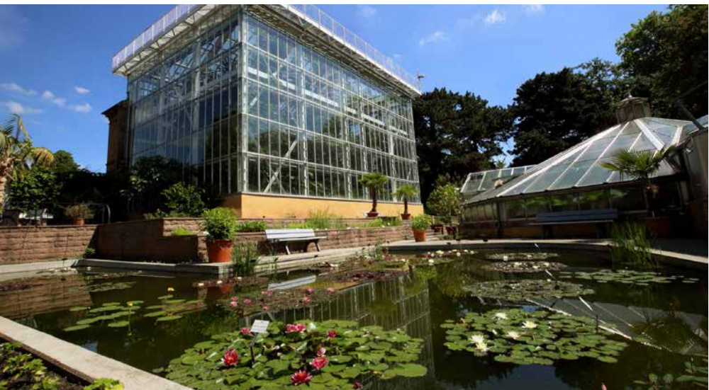
Tropic house at the botanical garden.