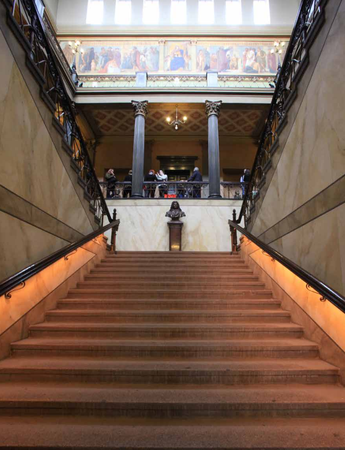
Stairs in the Löwengebäude