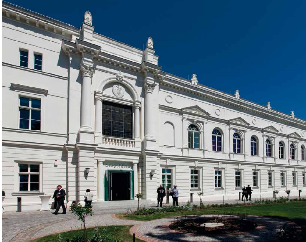
National Academy of Sciences Leopoldina – National Academy of Sciences