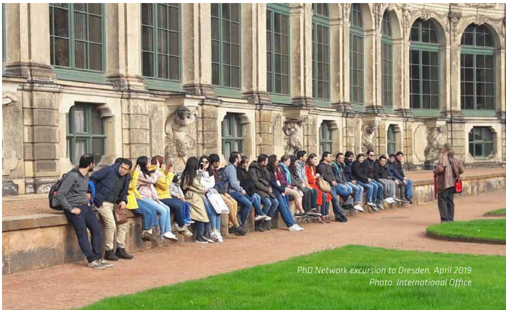
PhD Network excursion to Dresden, April 2019