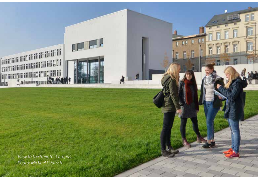
View to the Steintor Campus