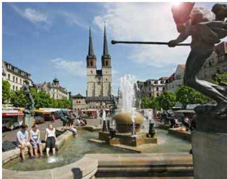
Handel House Halle