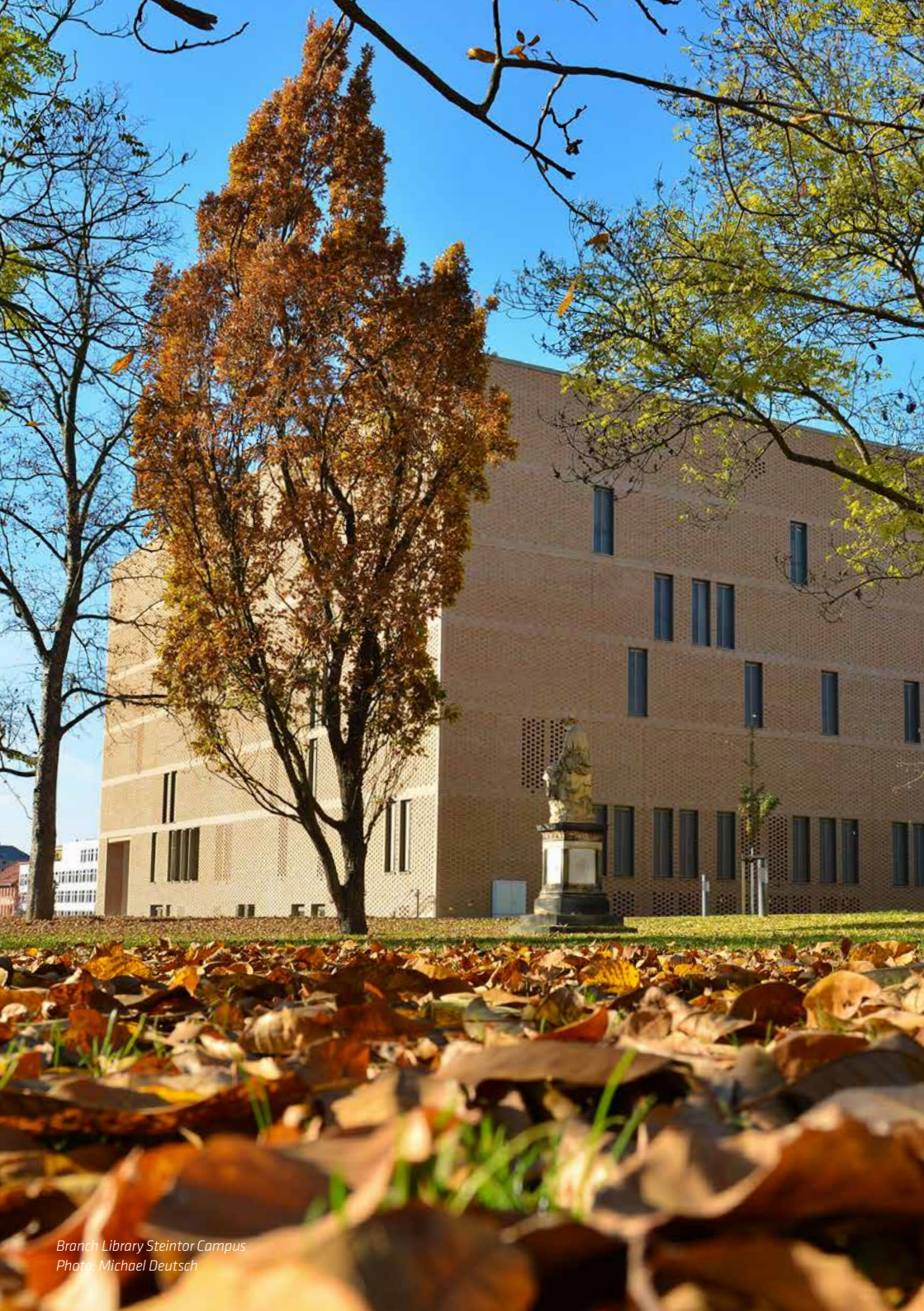
Branch Library Steintor Campus