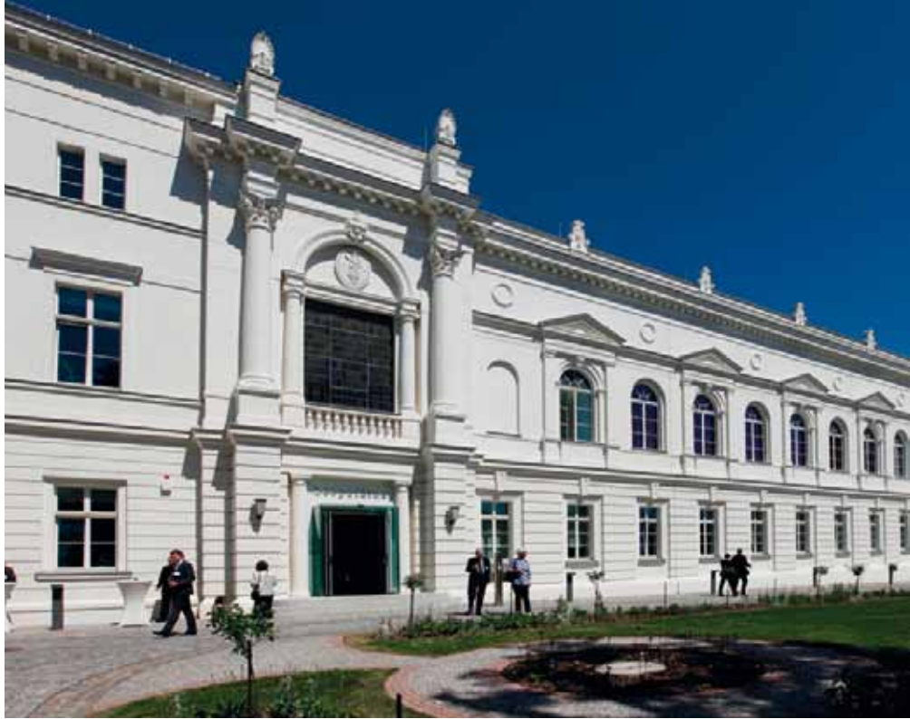
German Academy of Sciences Leopoldina – National Academy of Sciences