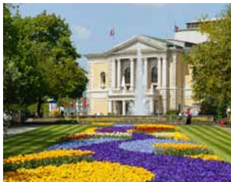
Handel House Halle