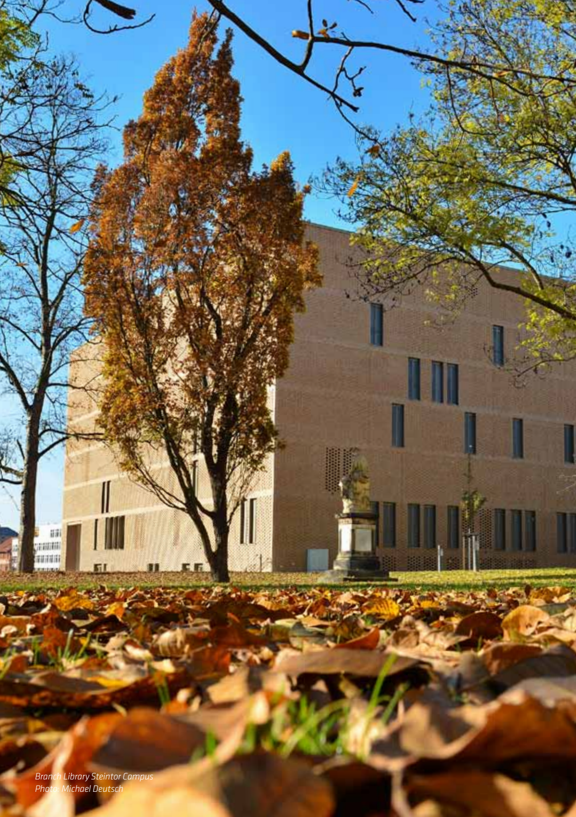
Branch Library Steintor Campus