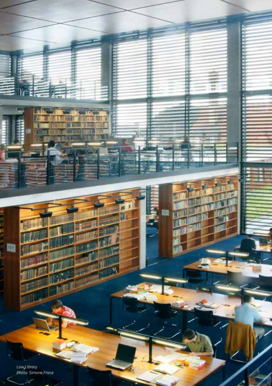
Law Library