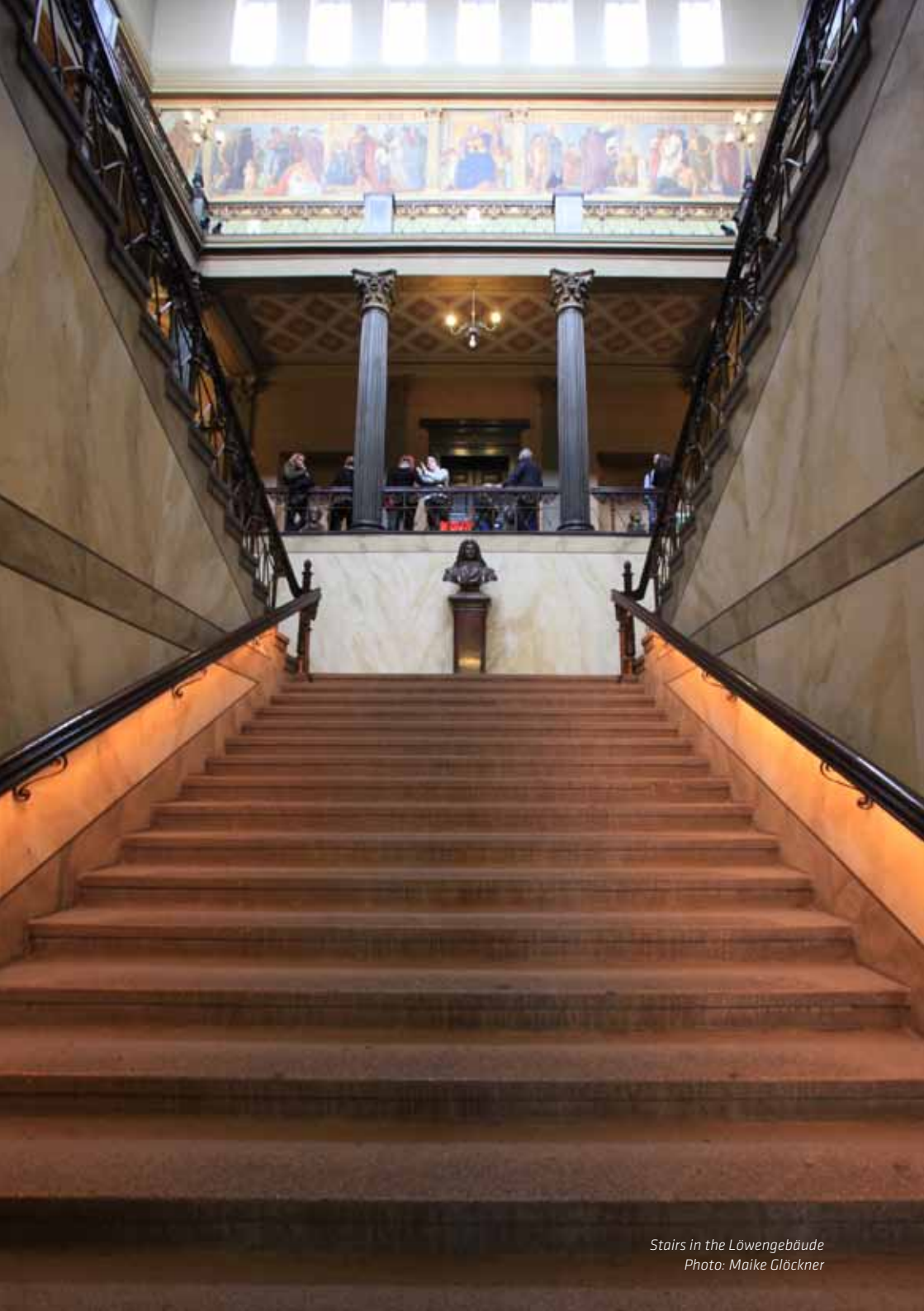
Stairs in the Löwengebäude