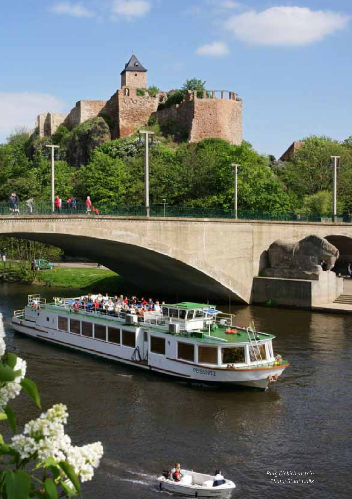
Burg Giebichenstein