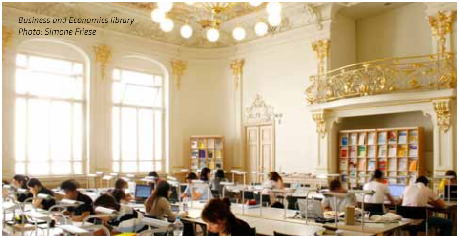
Business and Economics library

Internationally, MLU is part of an extensive network of partner universities, working together with over 200 universities all over the world in study programmes and joint research projects.