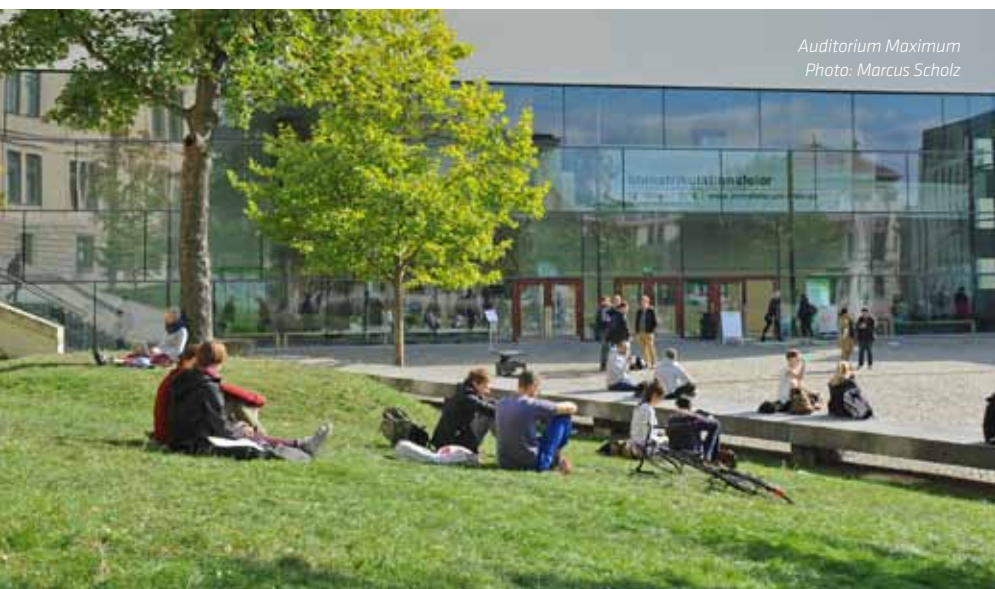
Auditorium Maximum