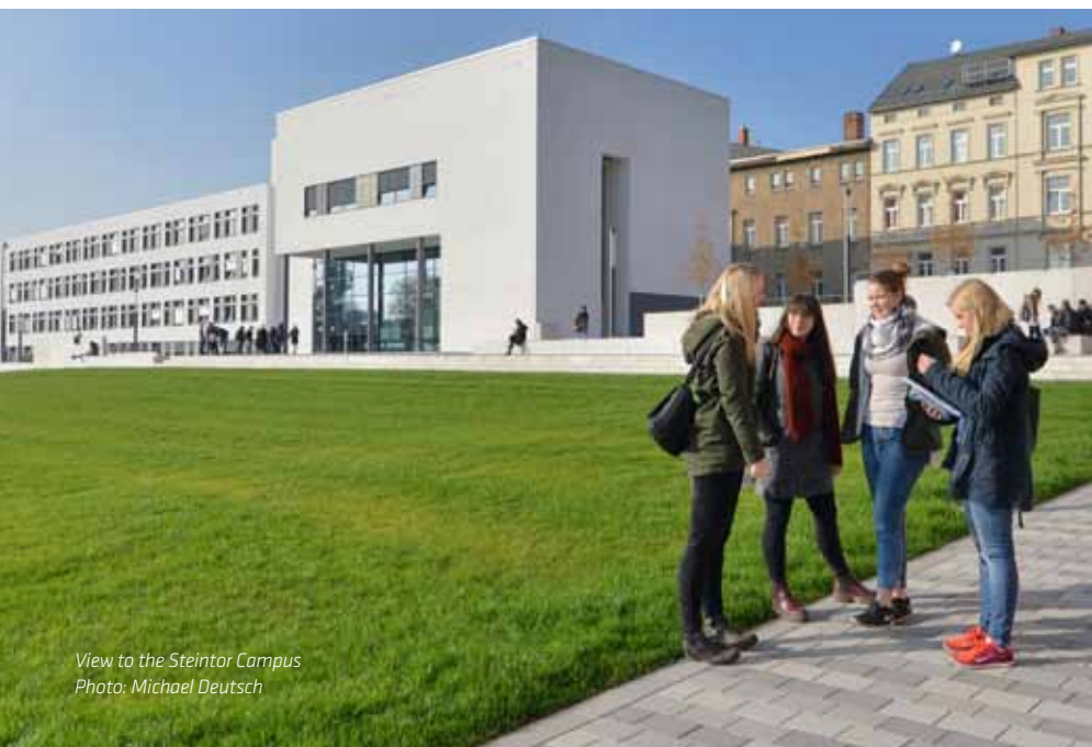
View to the Steintor Campus